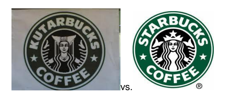
[Example provided by the Indonesia IP authorities]