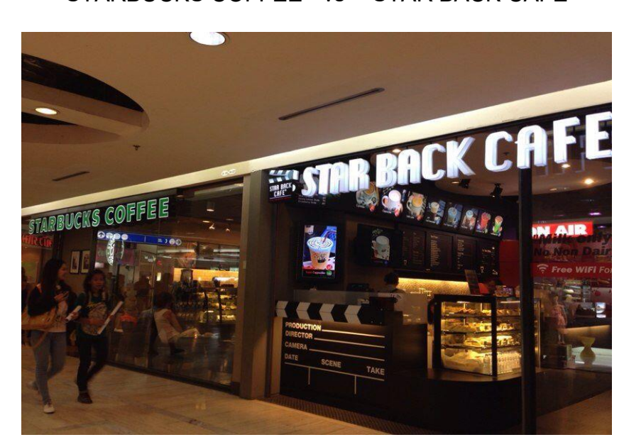
"STARBUCKS COFFEE" vs "STAR BACK CAFÉ"

The following example illustrates the case where the above-mentioned levels of prejudice may concur to the detriment of the holder of a well-known sign: